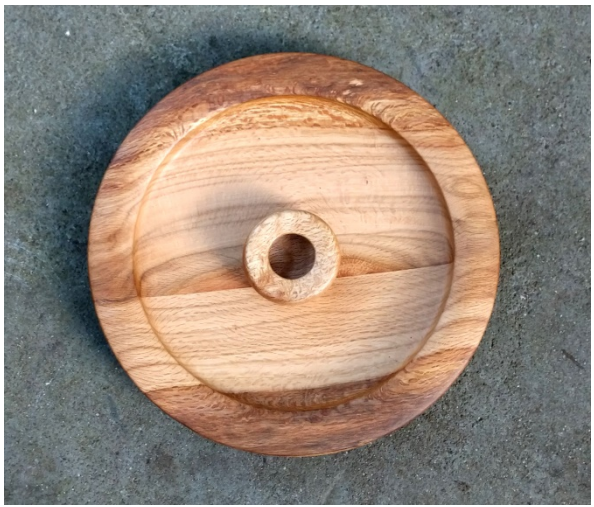
Coast Live Oak (16") (used to live next to my shop)

Enjoy the longer days, the greening of deciduous trees, the bursting of blossoms of every color...and warmer shops in the morning!