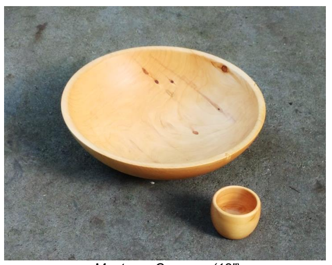
Monterey Cypress (18")

The theme for March envisioned something large and something small made from the same wood, ideally the same blank, if that's not a stretch. That could be something like the examples below, but you'll definitely use your imagination in ways that go far beyond a pedestrian president!