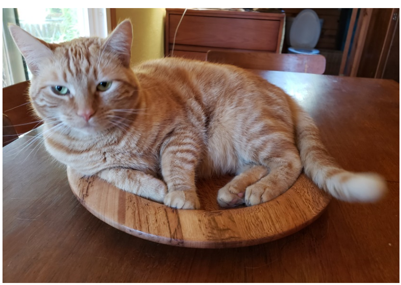
The purrfect platter

You just never know how those objects will be used! (This rather large cat found bliss on a Chinquapin platter made from his personal tree in Bonny Doon...a fire survivor with attitude and taste!)