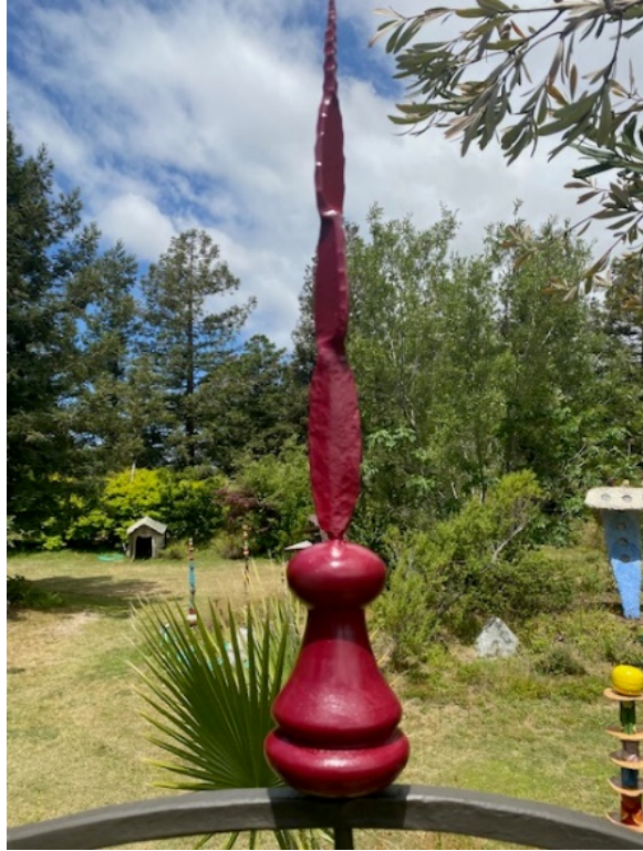
“Turned Accessories” to the Four Elements Gong...Leather-wrapped gong bonger, and dyed wood finial

Speaking of interactions of metal and wood , several of our members have told some interesting stories about the inevitable discovery of a nail...or something much bigger...hiding in a bowl blank. That’s the downside of using wood from the first 6 or 8 feet of a tree that grew up with people nearby.