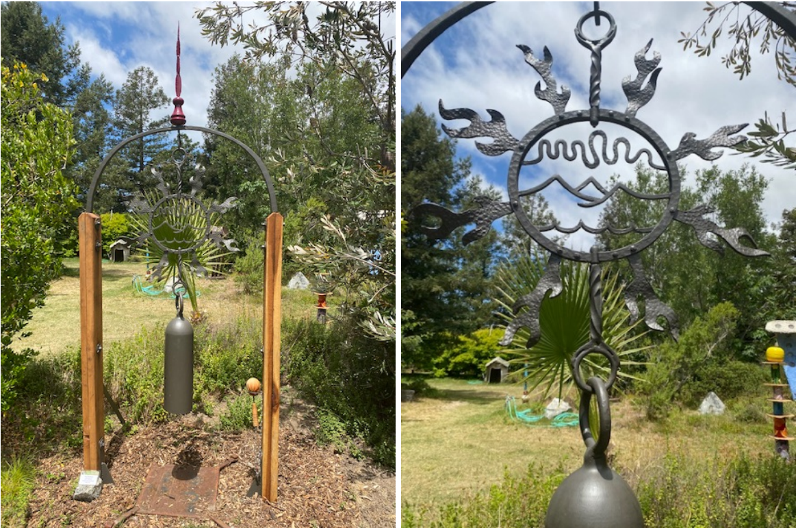
Details of the wood turned components of the Four Elements Gong next page!

Meanwhile, Roy delivered his Four Elements Gong to the "Sculpture Is" show at Sierra Azul Nursery. Wind, Sun, Fire, and Water...pretty much sums up Santa Cruz!