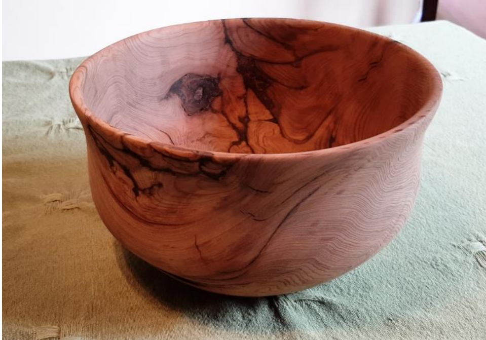
Freshly turned and sanded