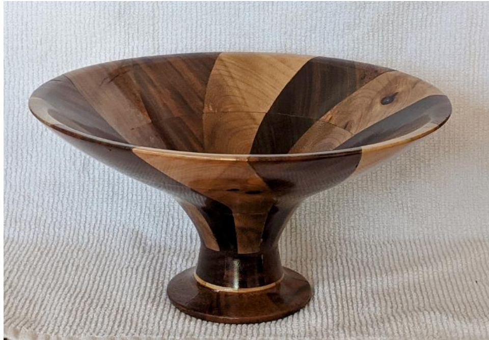
Ash and walnut "pinwheel" spiral, about 7" diameter, 6" high