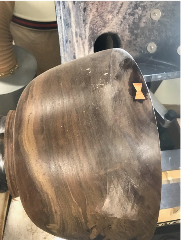
Nice work, Dan Aldridge. I sense a crack-mitigation topic for a future demo when we can get back into a real shop in person!