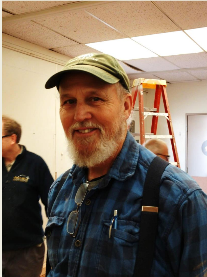
Finishing School Santa Cruz Woodturners July, 2020