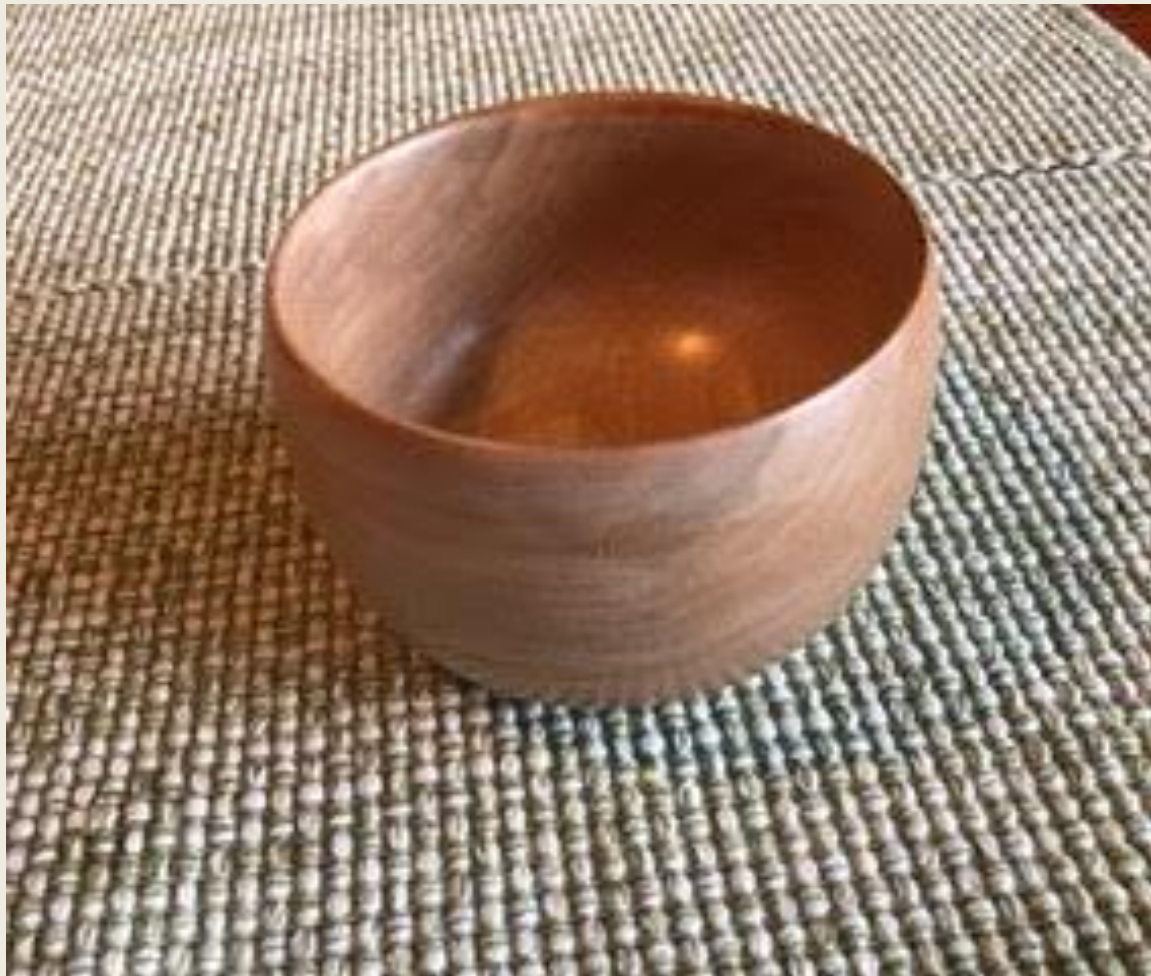
Finishing School Santa Cruz Woodturners July, 2020