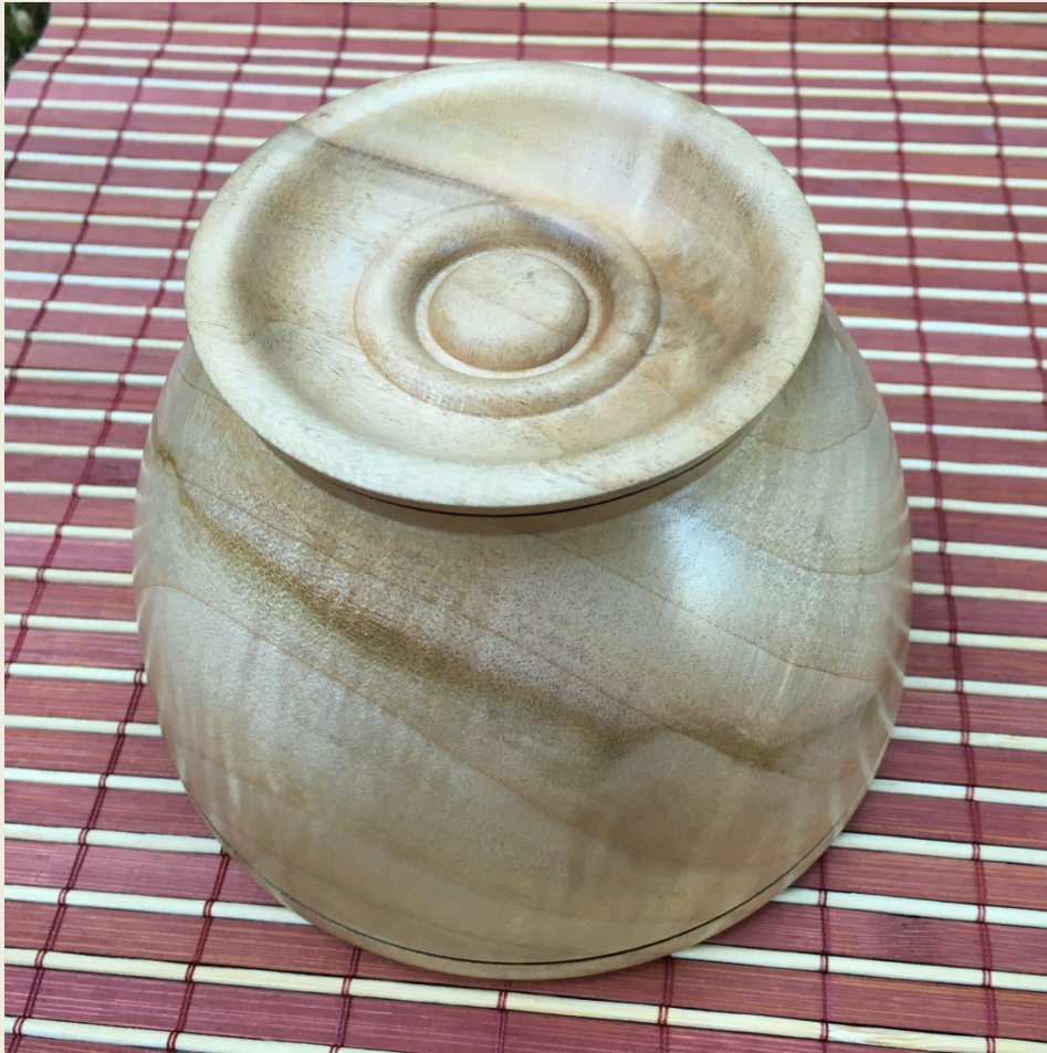
Finishing School Santa Cruz Woodturners July, 2020