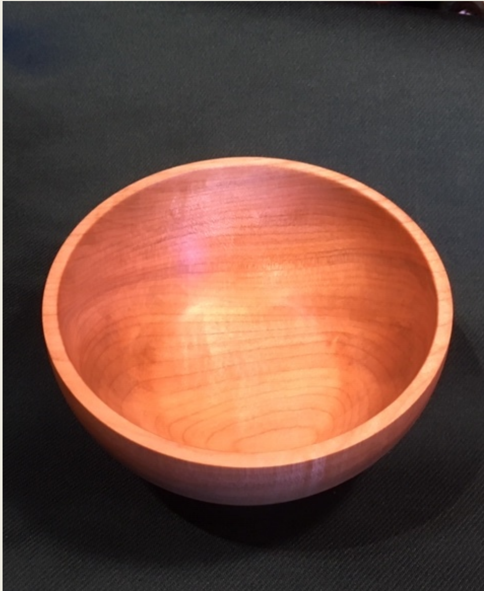
Finishing School Santa Cruz Woodturners July, 2020