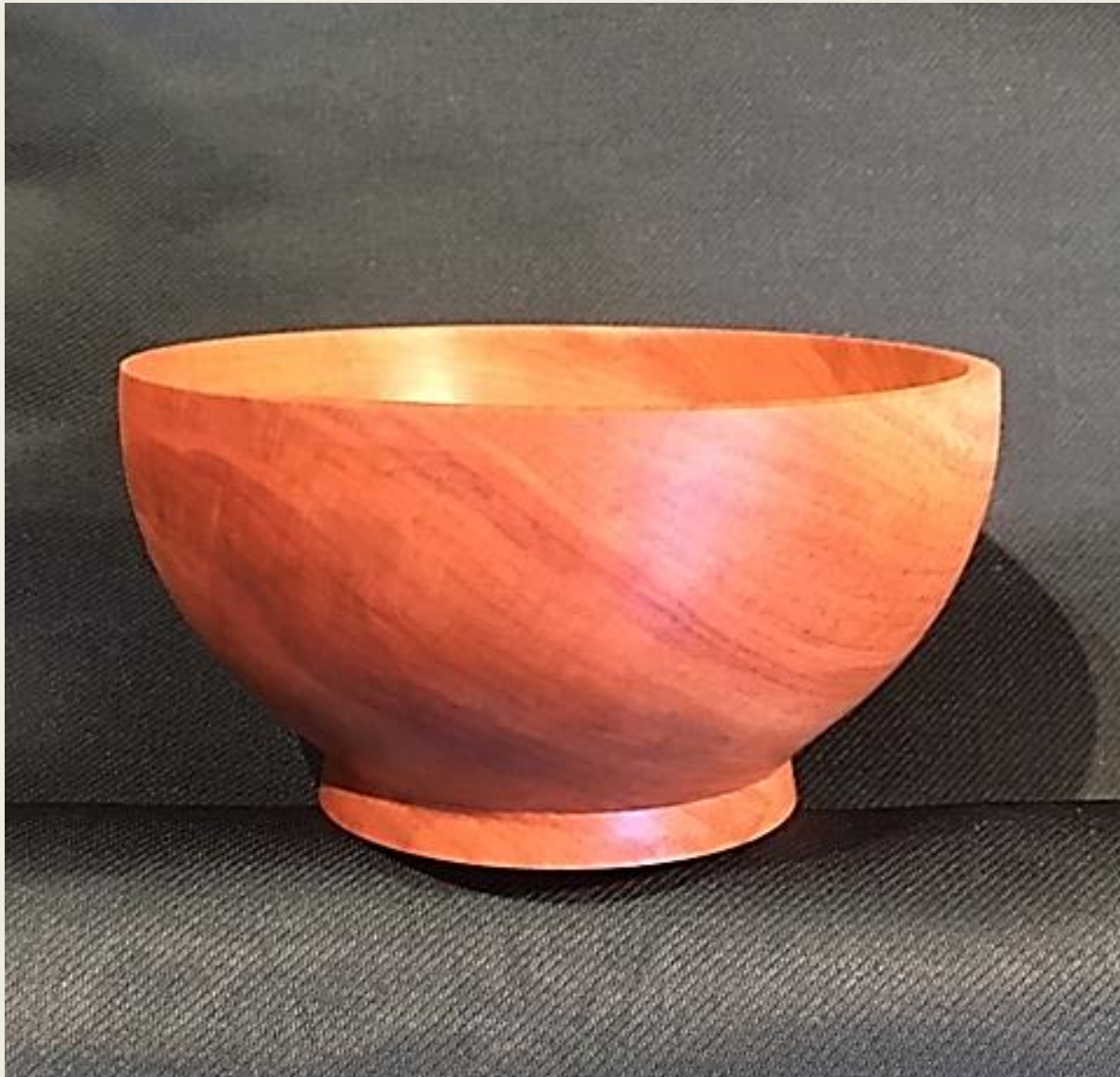
Finishing School Santa Cruz Woodturners July, 2020