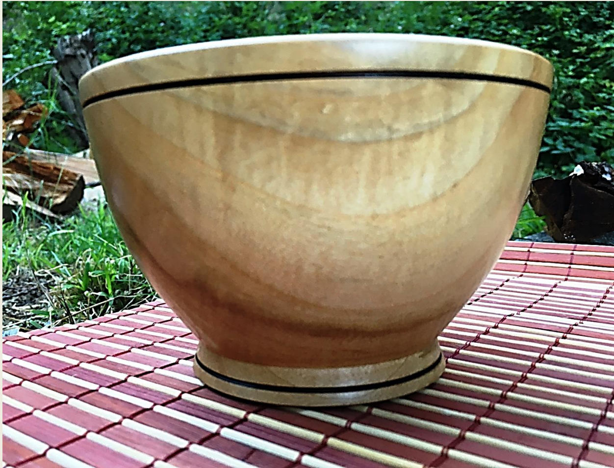
Finishing School Santa Cruz Woodturners July, 2020