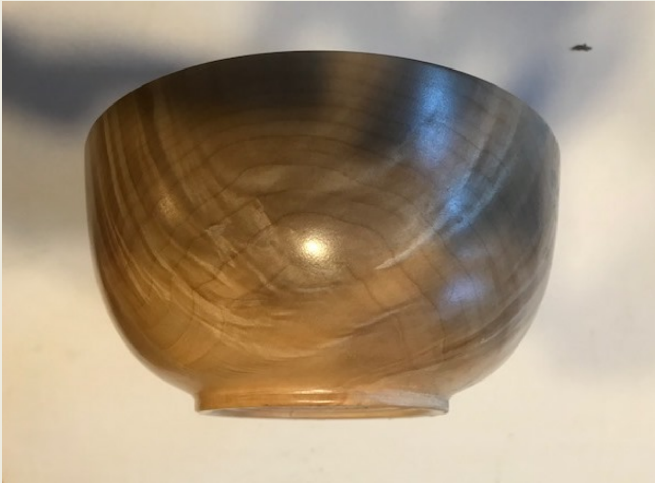
Finishing School Santa Cruz Woodturners July, 2020