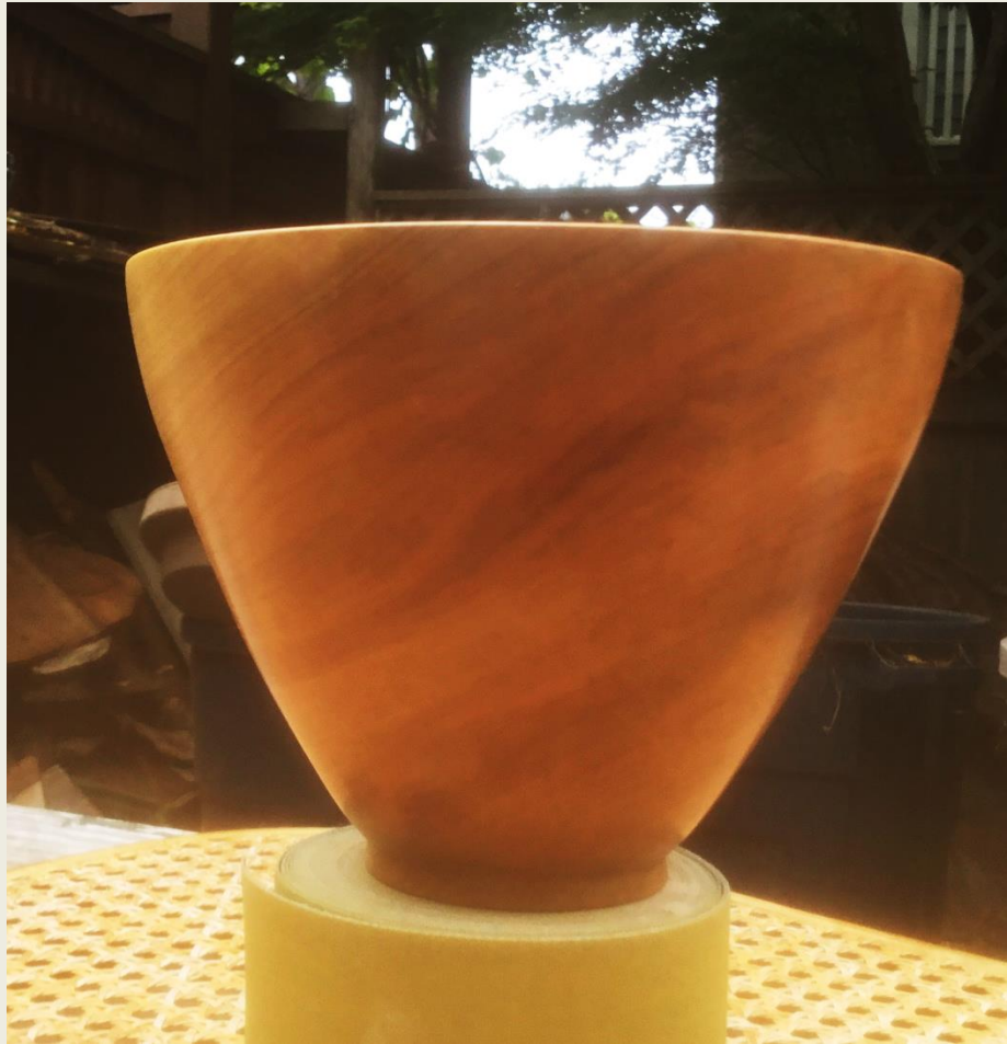
Finishing School Santa Cruz Woodturners July, 2020