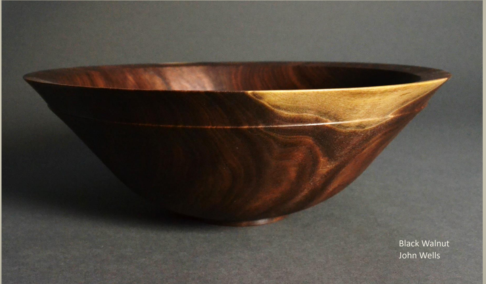
Black Walnut John Wells