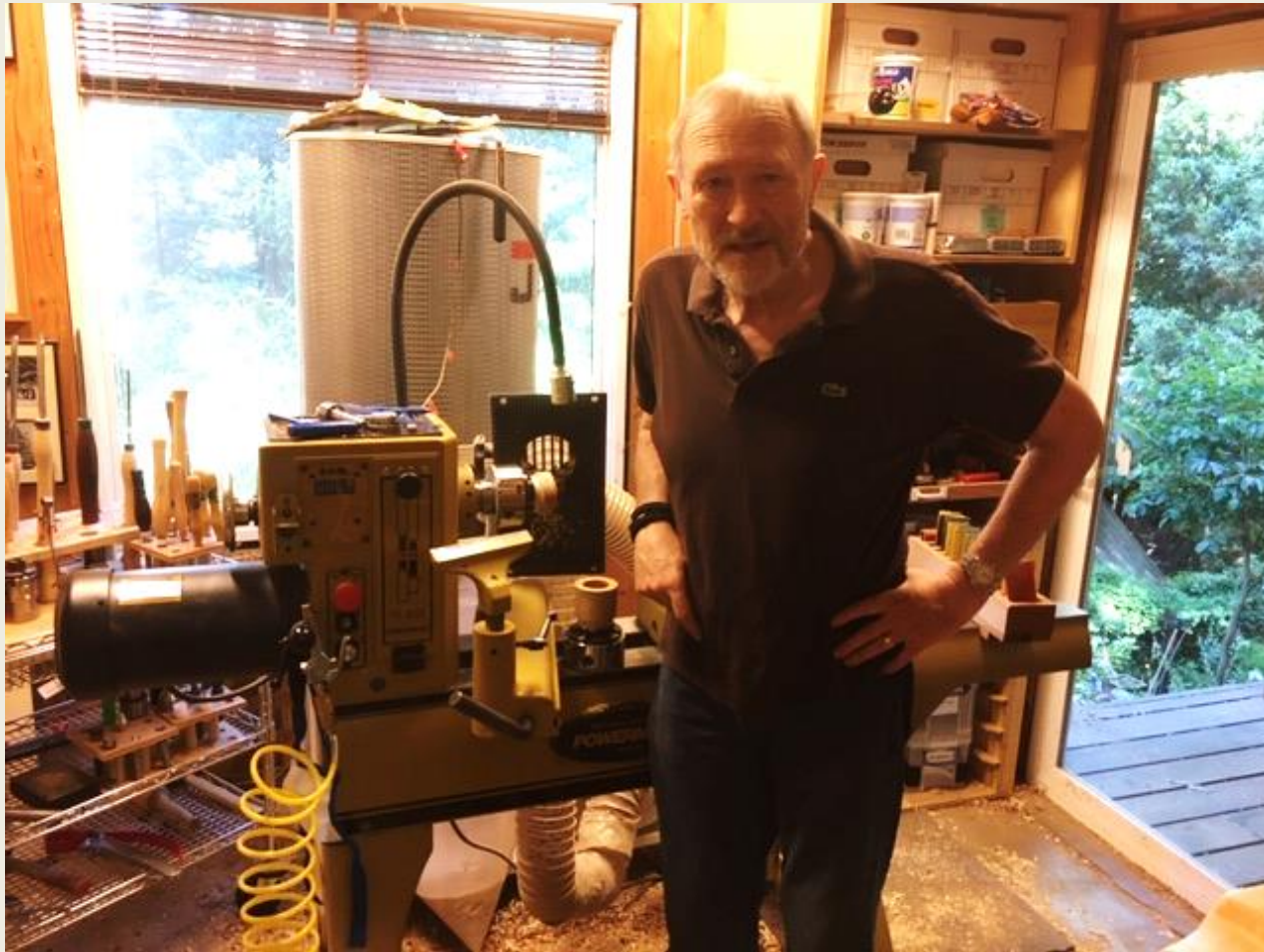
Finishing School Santa Cruz Woodturners July, 2020