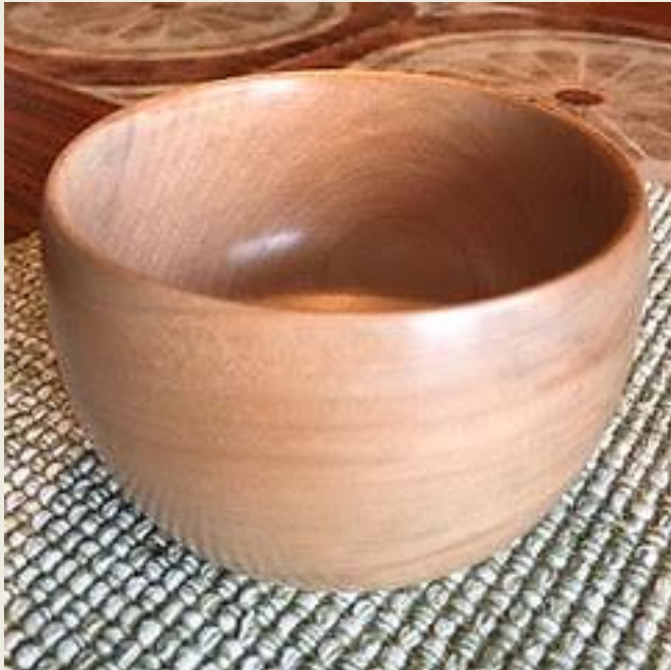
Finishing School Santa Cruz Woodturners July, 2020