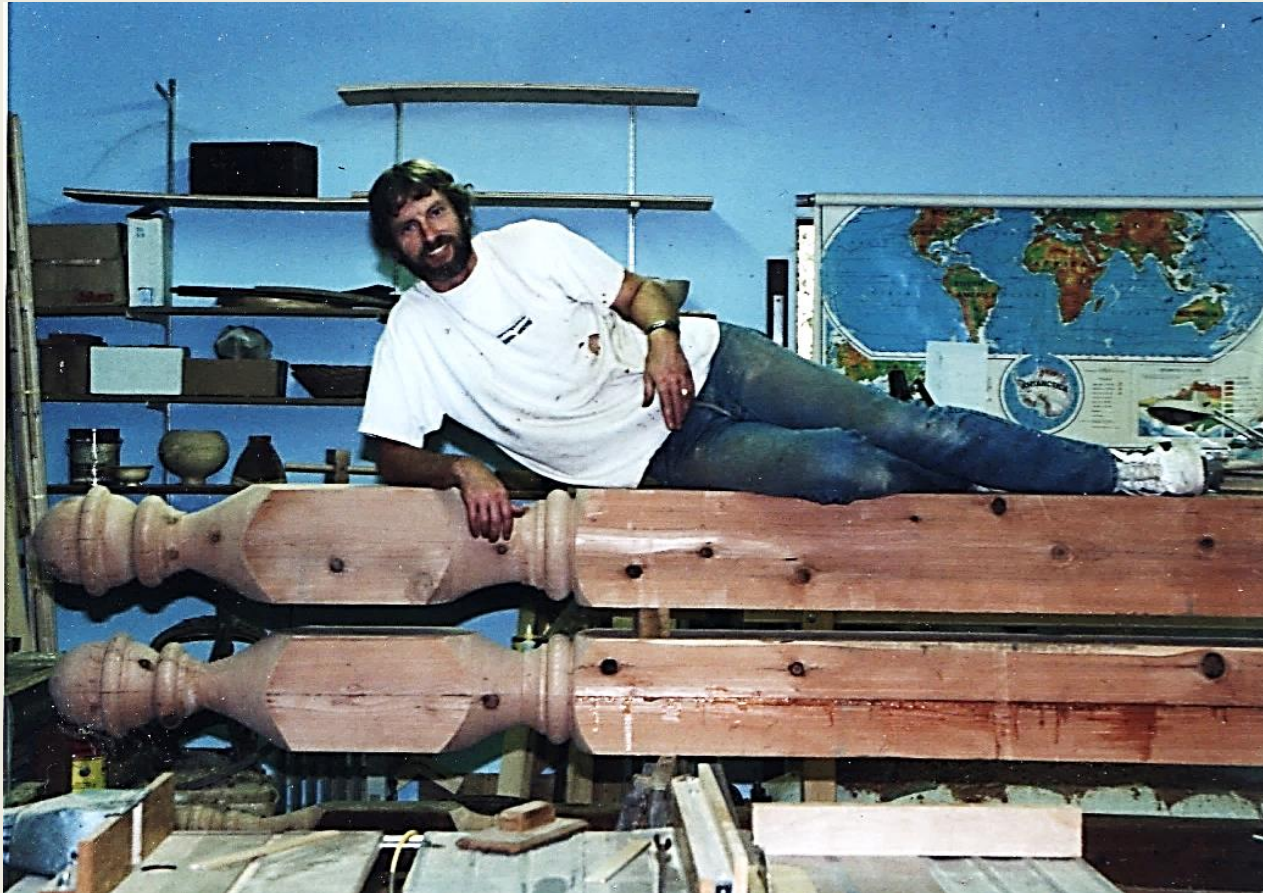
Finishing School Santa Cruz Woodturners July, 2020