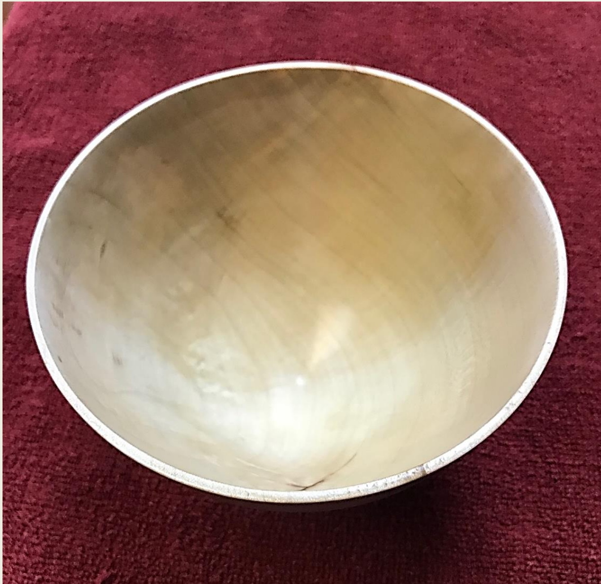
Finishing School Santa Cruz Woodturners July, 2020