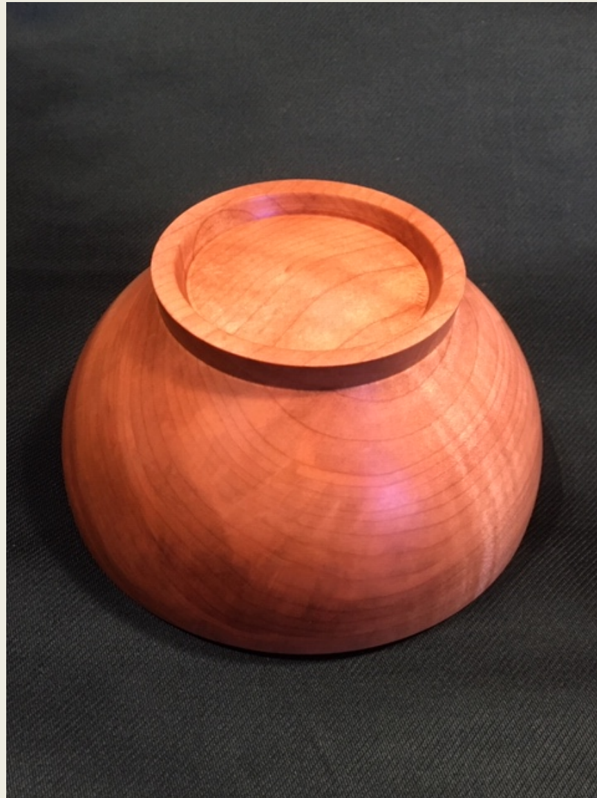
Finishing School Santa Cruz Woodturners July, 2020