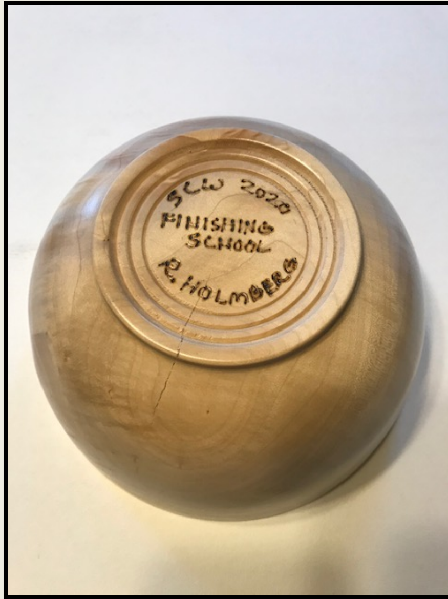
Finishing School Santa Cruz Woodturners July, 2020