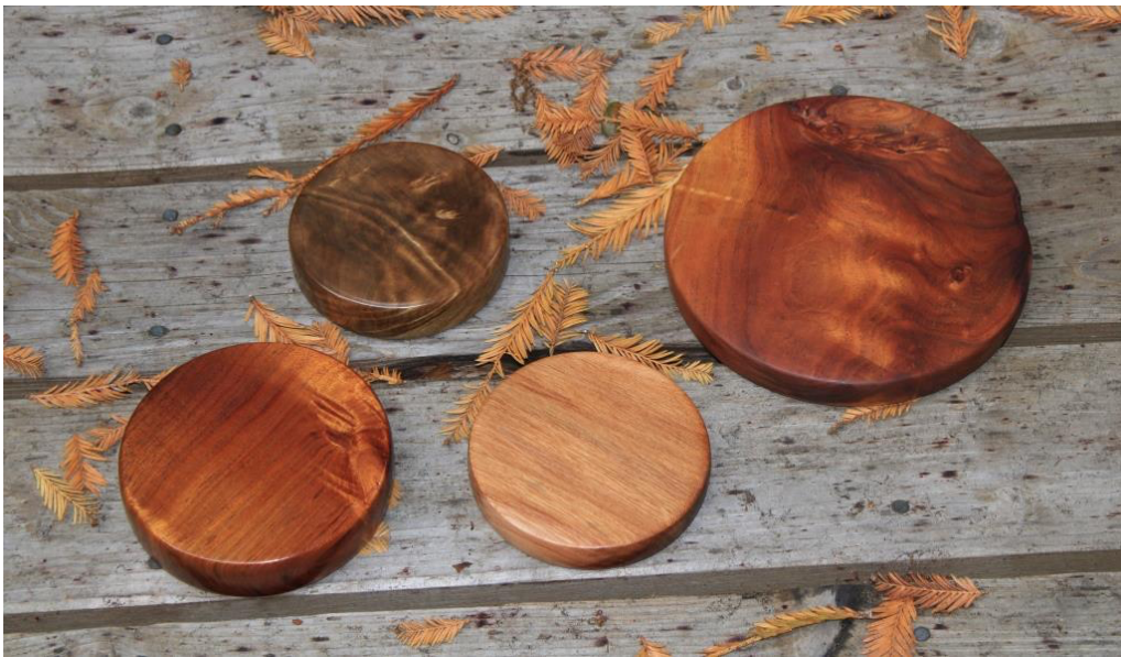
Trivets of redwood, bay laurel, tan oak, & black acacia. (Deck boards are 5.5" for reference)