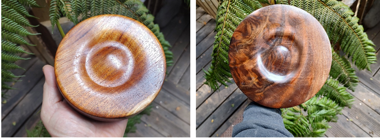
Black Acacia 5" left and figured Black Walnut 7.5" right. We all know that companion turners are going to check the bottom of your work!

*** Silicone feet. 3 are enough for a small trivet, better 4-6 for larger ones to avoid tipping. These are "grippy" and non-skid for security, too.