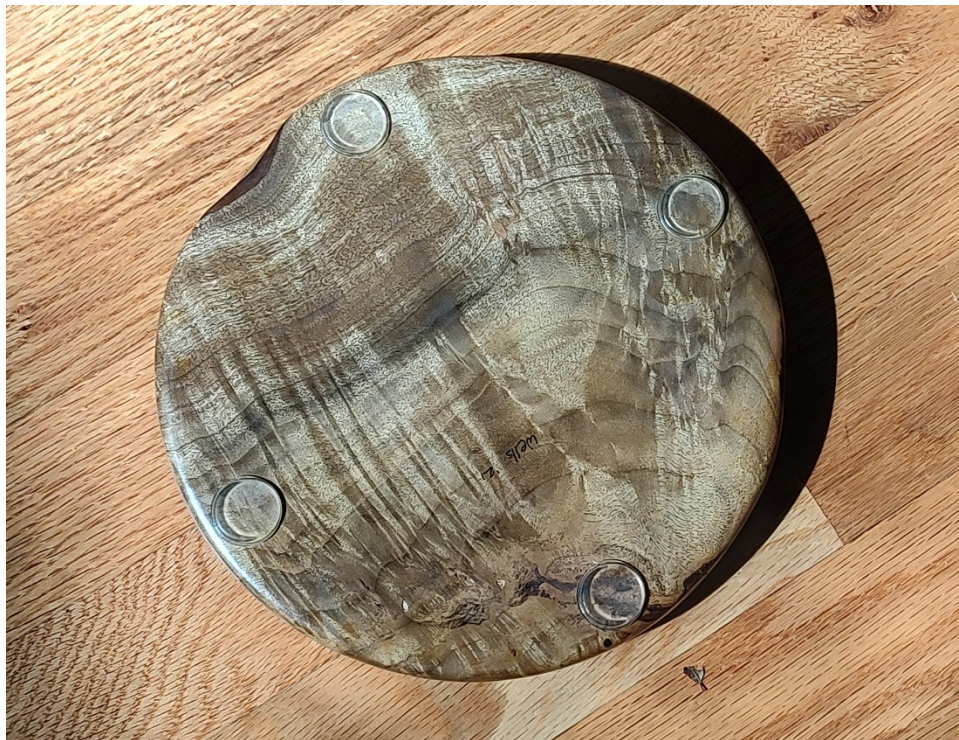
Bottom view: Nicely figured bay laurel 7.5" disc with silicone disc bumpers/feet.

*** Silicone feet. 3 are enough for a small trivet, better 4-6 for larger ones to avoid tipping. These are "grippy" and non-skid for security, too.