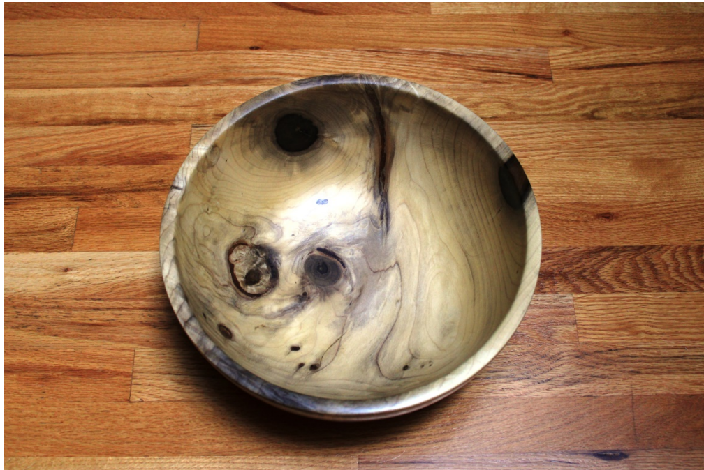
Magnolia bowl (14" diameter) with magic spot below

Send me some photos (attachments to e-mail work best) of your recent work so we can share the inspiration, the teaching, and the fun. Oopsies are important, too!