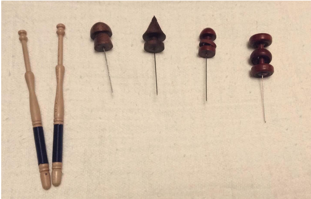
Tim's lace bobbins and divider pins...note the free rings.

Tim also found a way to mount a jam chuck without spending $60.