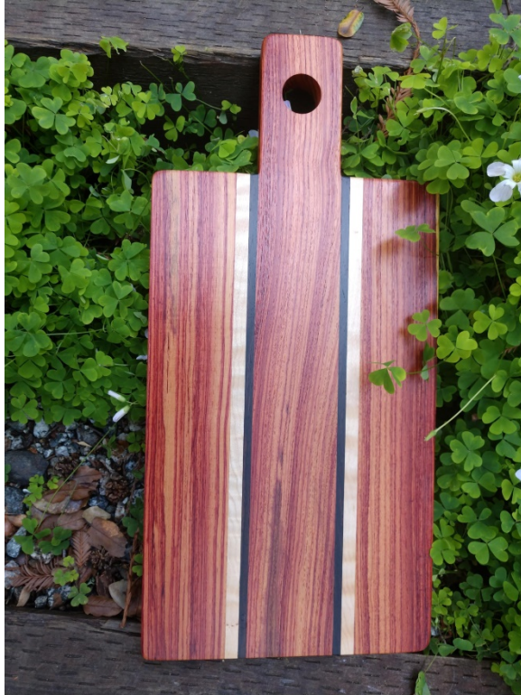
OK, Man does not live by lathe alone...