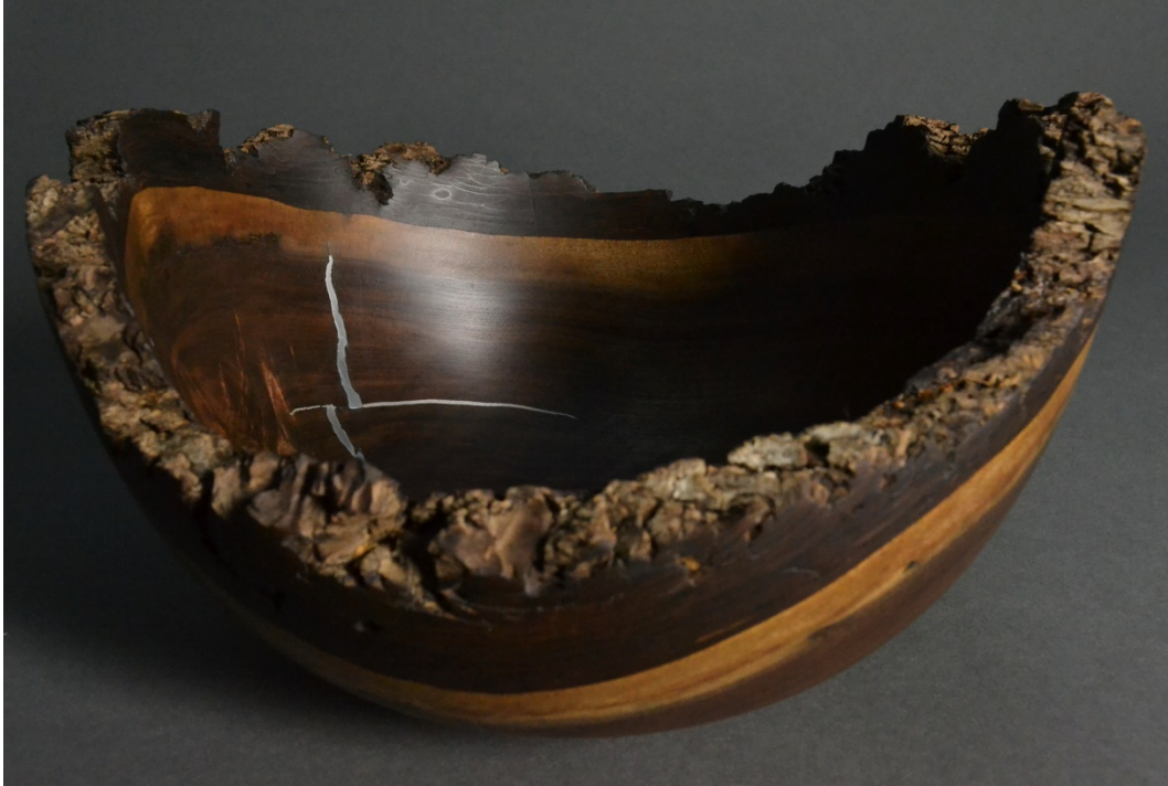
Natural edge walnut with pewter inlay. Magnificent, John!