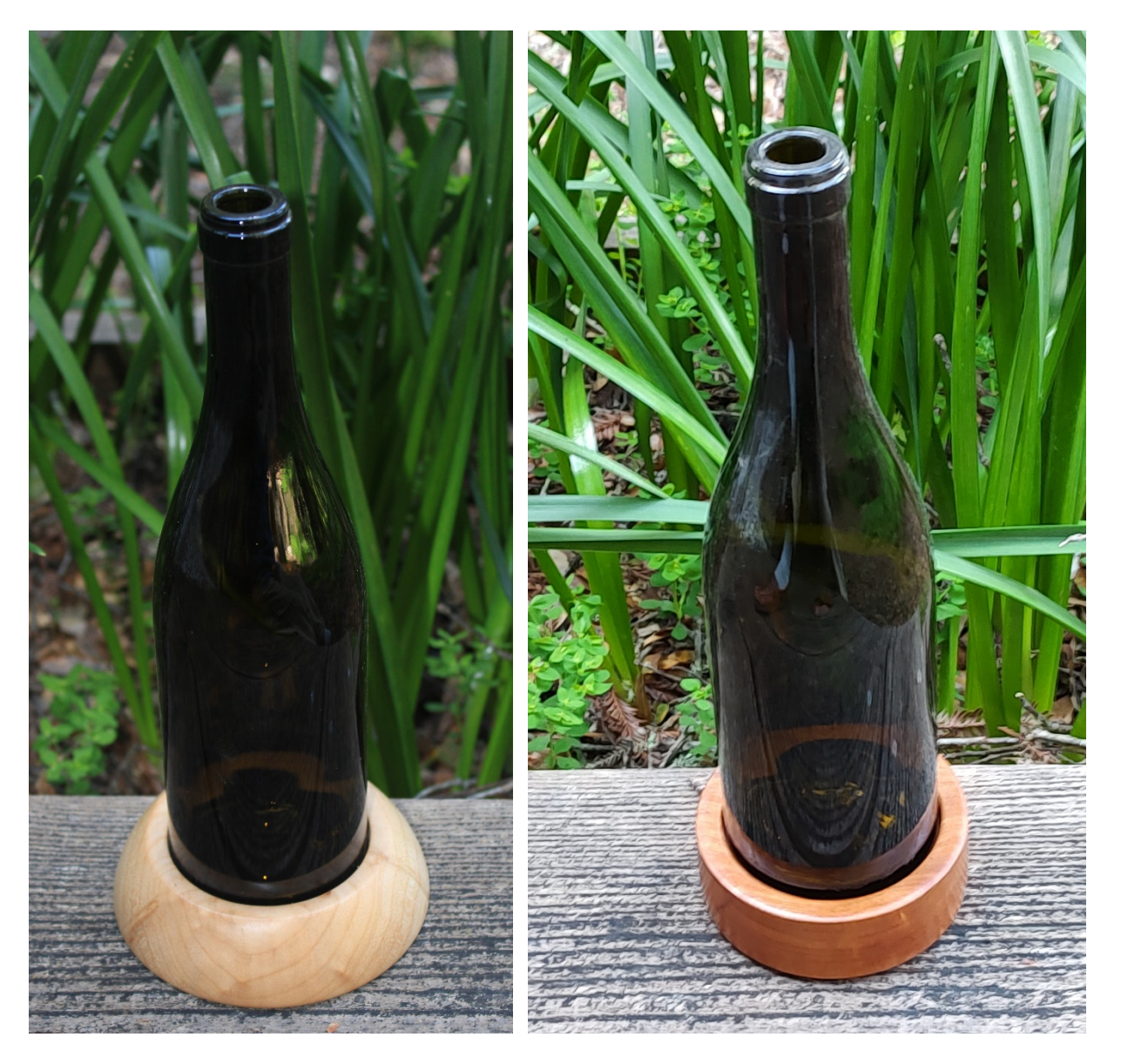
Wine Coasters—Maple and Cherry here.

Any blank 4–4.5" diameter, 1.25-1.5" thick will do. Redwood or lpe deck cut-offs, scraps too small for a salad bowl, a rejected project with clumsy uppers but a sound tenon...so many possibilities!