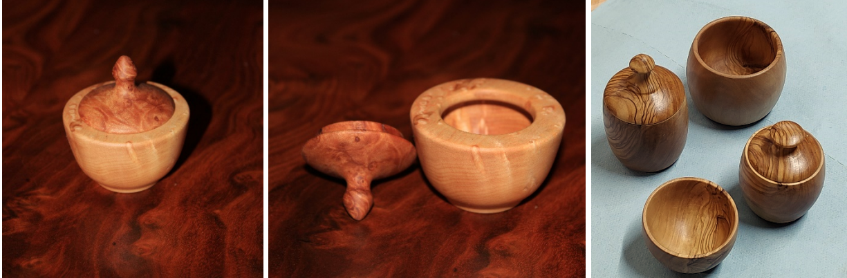
Birdseye Maple and Olive. These all fit in one's palm

Simple or elaborate, people love little places to store their goodies. Little boxes are a fine destiny for pieces of figured wood too small for salad bowls...and bowling pins.