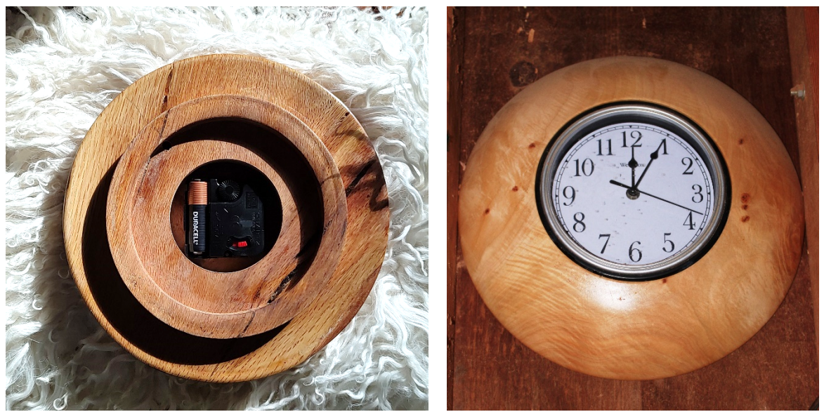
Battery & Mechanism in place

The oak design could be...a shimmery ocean tucking into an inlet on a sere desert island under an artist's mackerel sky. Better than a smiley face and definitely better than kindling! Need a blank 4-10" diameter, 1.25-1.5" thick, to accommodate a battery powered mechanism which runs 6 months on a single AA battery. Available online (Woodcraft and others), with a wide range of sizes and designs of hands. Circular thermometers look good framed in wood, too! Expect to spend around $15.