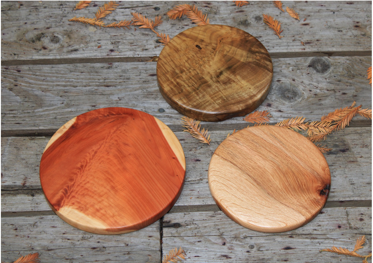
Trivets—for cut offs too shallow for a platter, too pretty to turn into BTU's

Criteria for the Turner: Fast, inexpensive, entertaining...with materials you have lying around. Spend a little more for special gifts, needless to say.