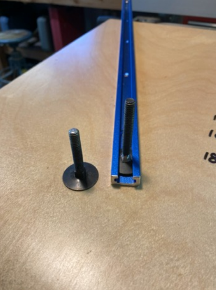
Tightening screw from the underside. Note drilled hole in center of channel for this bolt post.