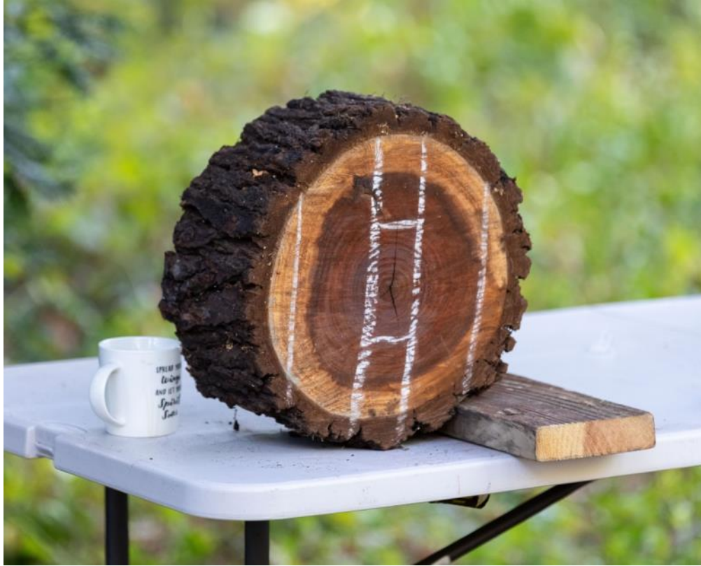
Basics of cutting blanks from a log. A little easier said than done.