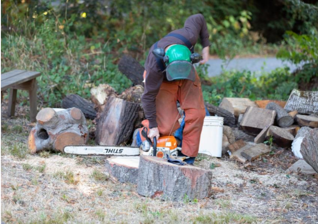
Dan fires up the big fella...and gets down! Note the manly chaps!