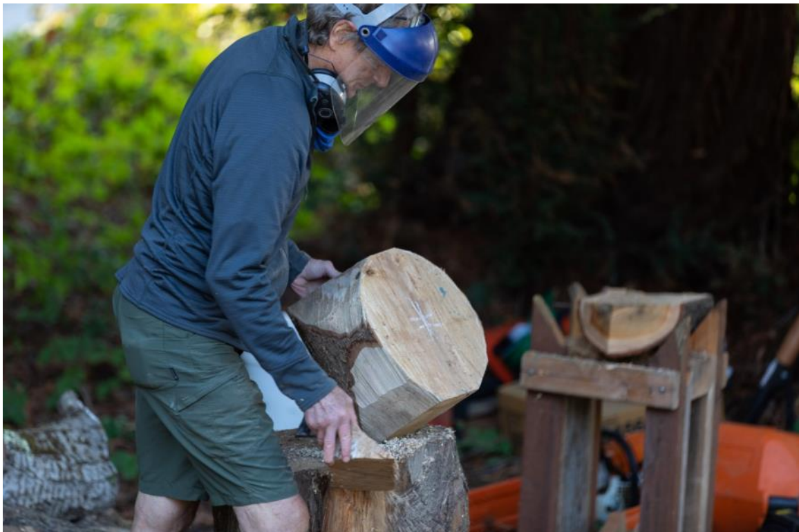
Deep bay blank just about ready for the lathe