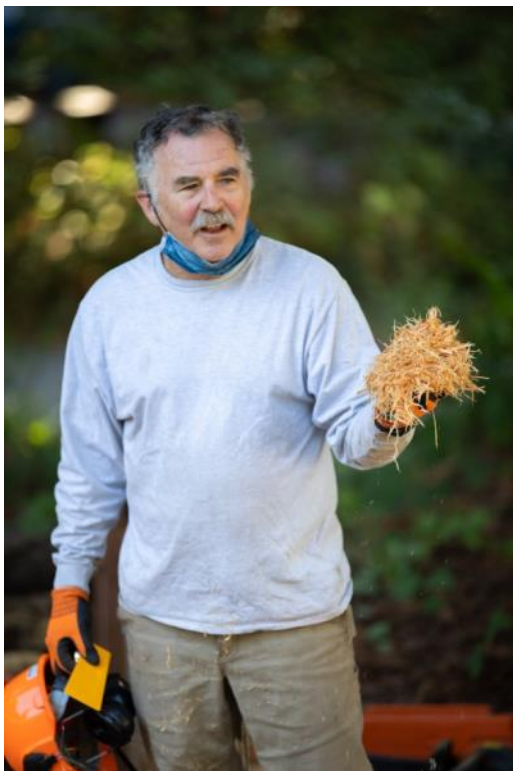
And a thatch of Cypress ribbons