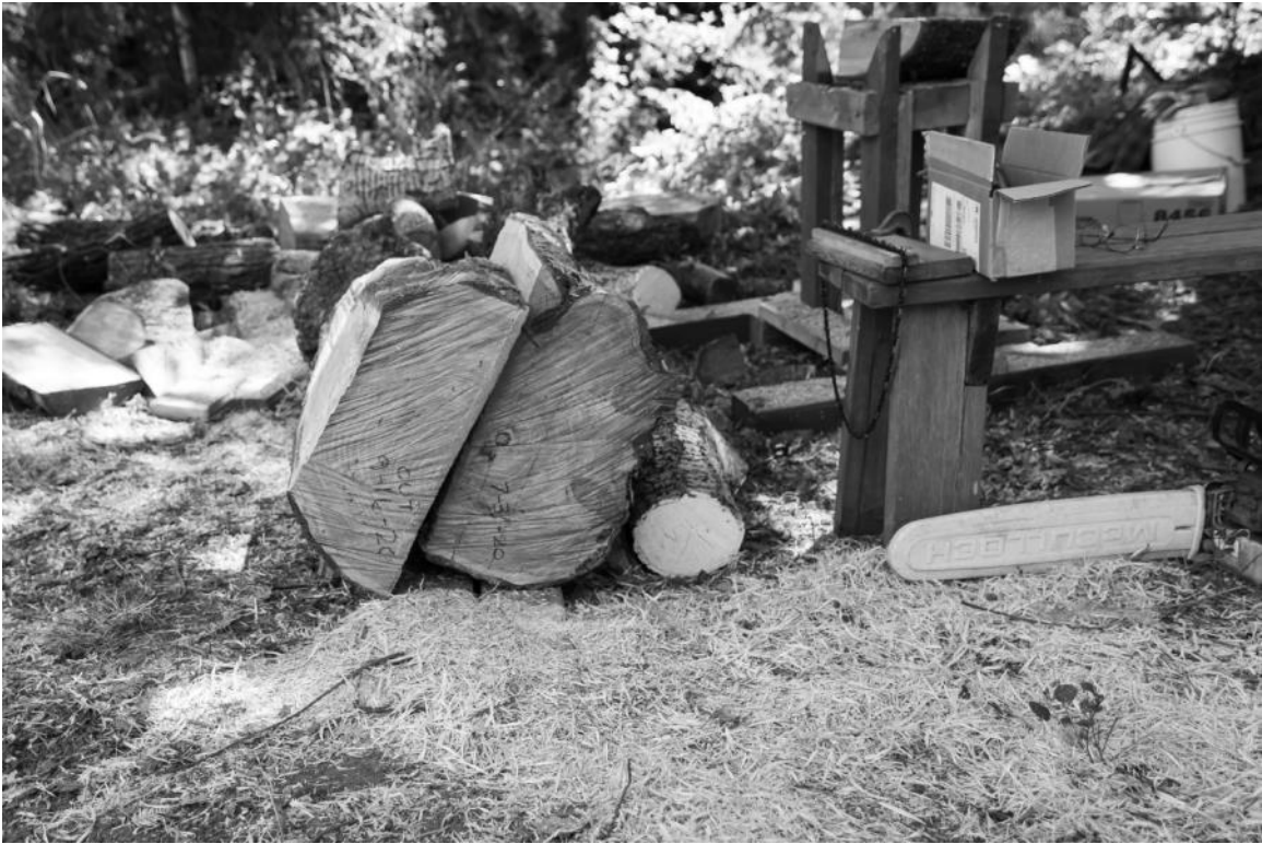
A fine day