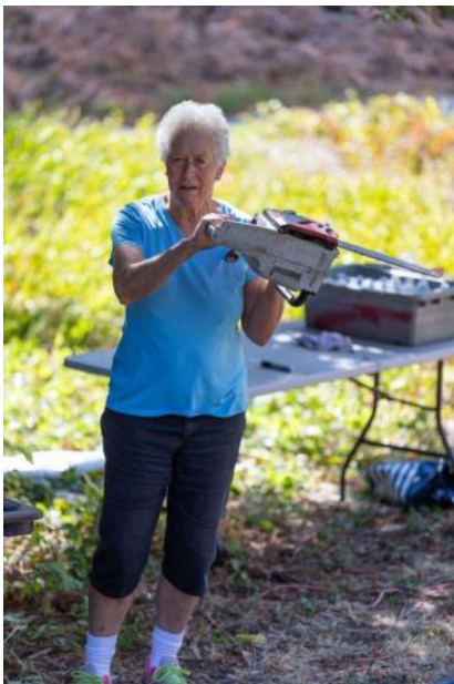
Except when she's putting steel to wood in the shop or the orchard