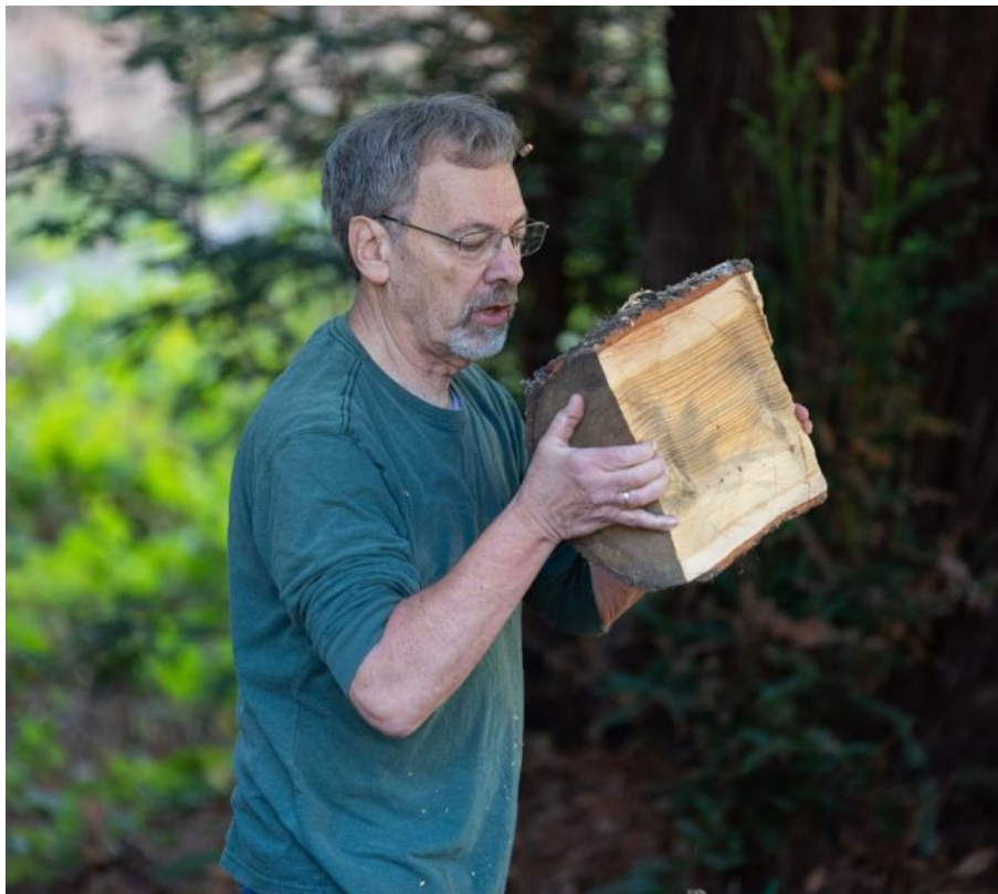
A Pear wood half-moon...on its way to becoming a hemisphere