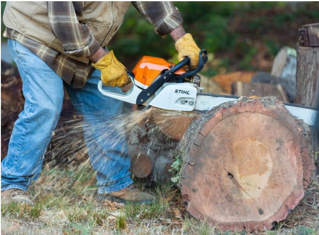
Experienced hands...clean saw