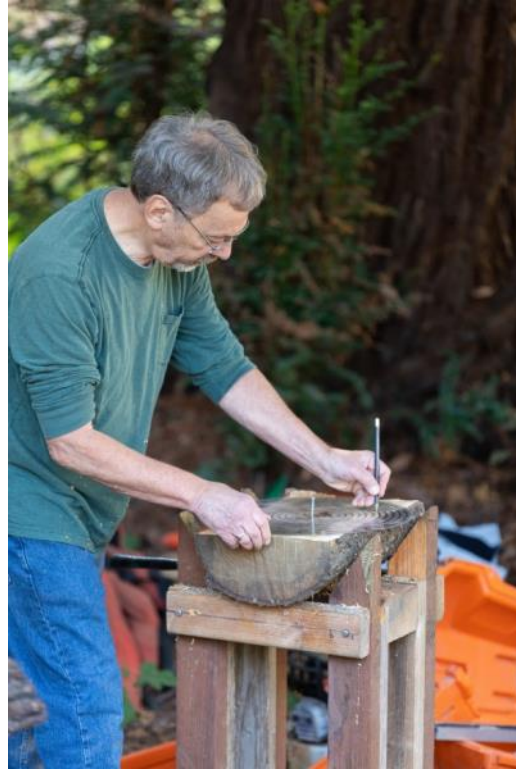
Marking the blank