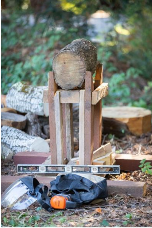
Raf's Faithful Horse