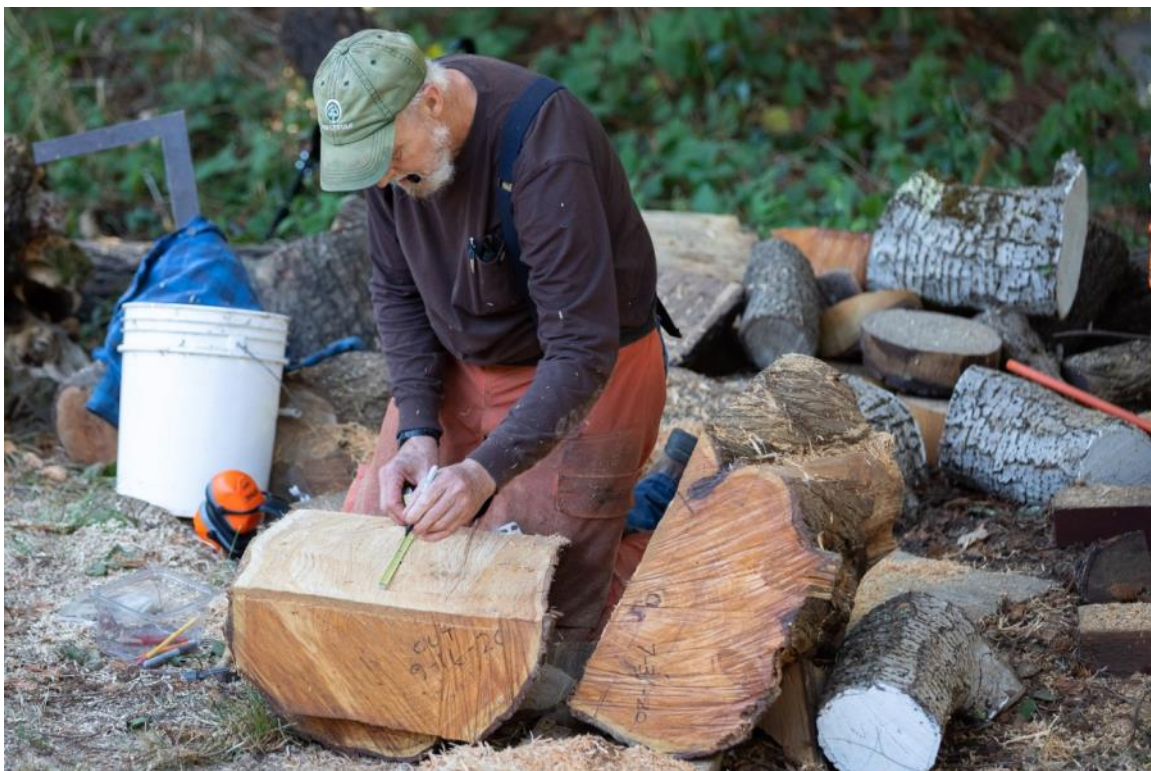
Measure twice, cut once