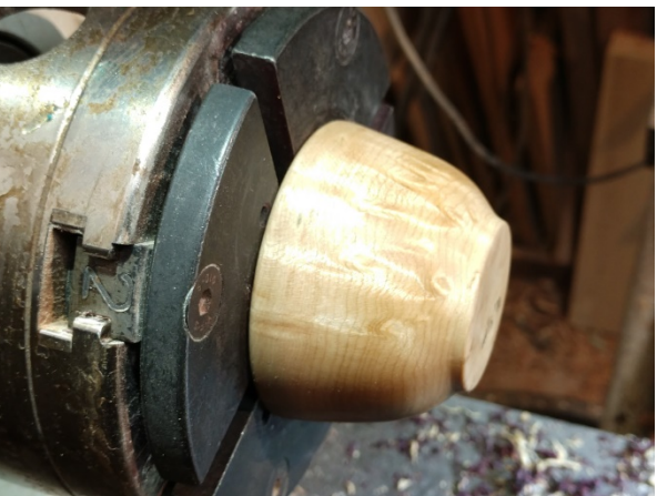
Mounted in non-marring fashion

Enjoy these shorter days. Consider buying some LED lights for your shop as a treat for the holidays.