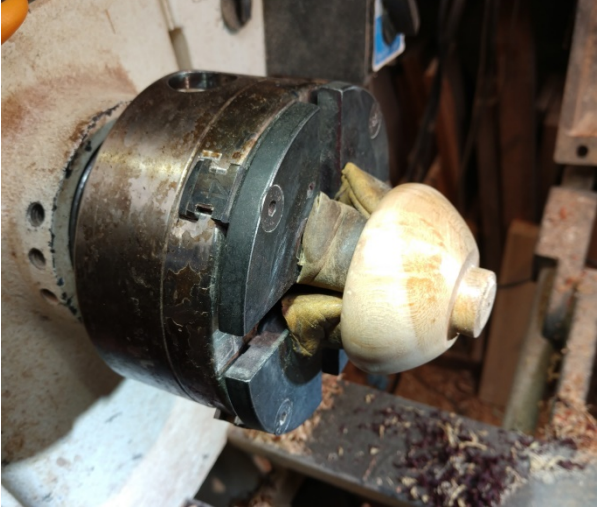
Expansion fit to grip incurved bowl