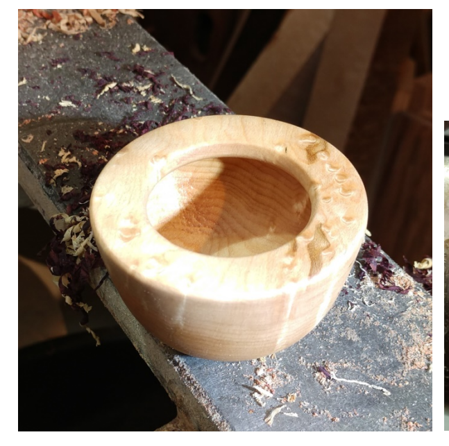
Wee hollow form on the ways Hate to scuff that delicate rim.